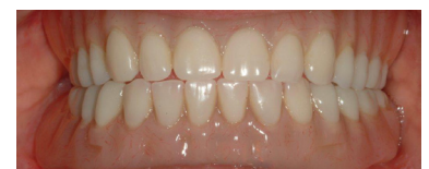
Restores smile and function

To keep the tissue under the appliance healthy and to prolong the life of the locator attachments, your denture should be left out of your mouth during sleep. The teeth in the denture are not as strong as your natural teeth and you will not be able to chew as heavily on them. The appliance will tend to get food trapped underneath it and you may have to remove and clean it after eating.