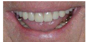
Restores smile and function