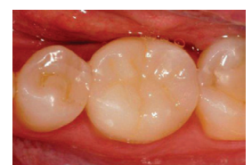
Silver fillings replaced by porcelain Inlays/Onlays